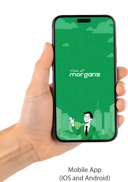
Mobile App (IOS and Android)